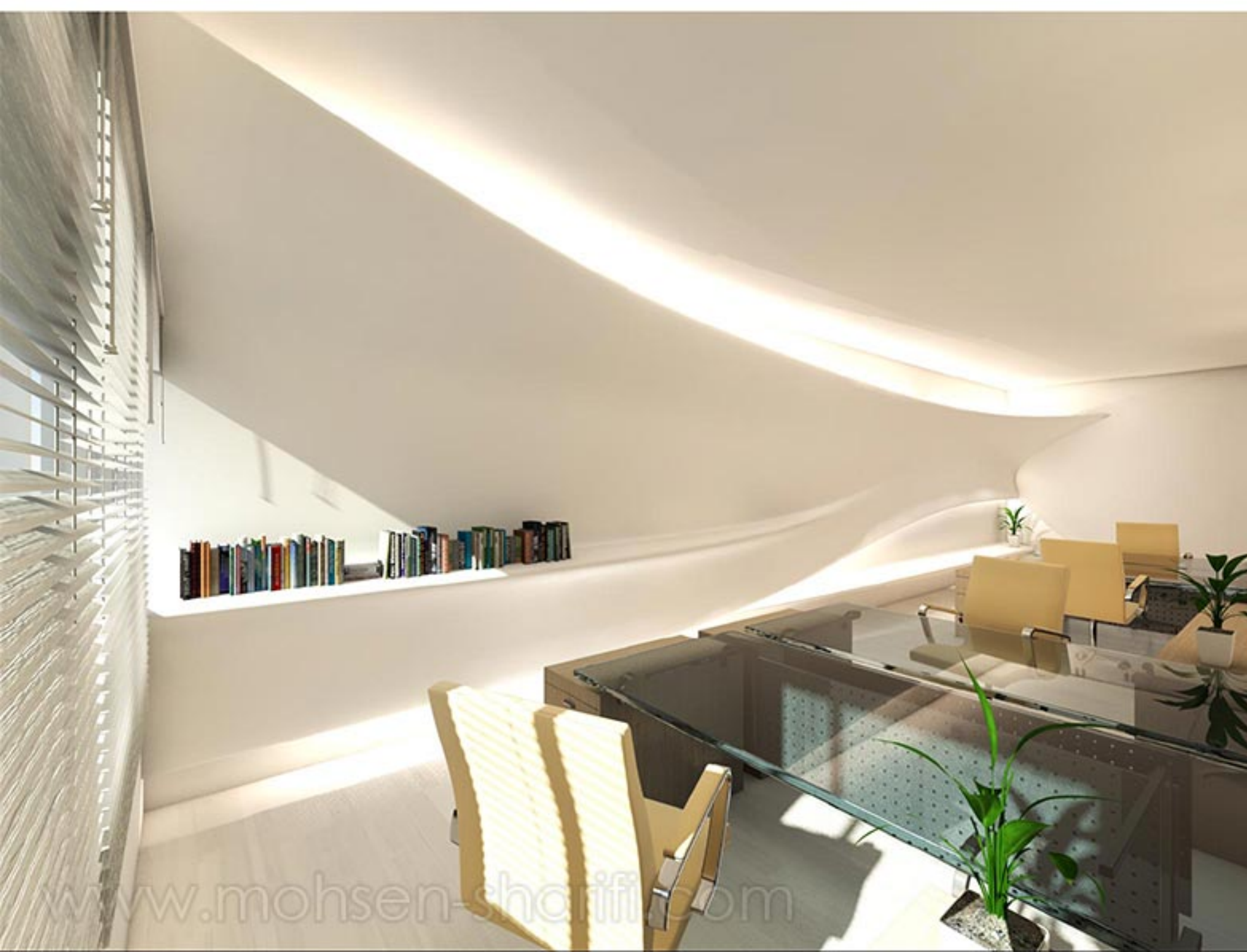
Structural frames under the smooth wall

Project Manager in preparing construction documents, integrated Lighting and Structure in to the design. Designed different alternatives for interior walls and proposed a solution to install them. .Also responsible for Modelling, Rendering and Post Production